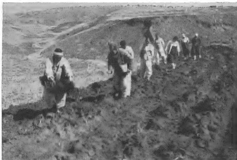
The peasants cultivate the land at night